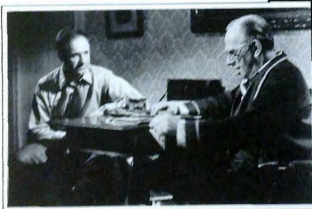
WHEN PARENTS GROW OLD