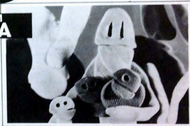
THE FABLE OF HE & SHE