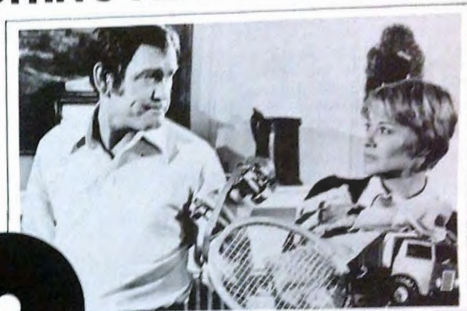
AM I WIFE, MOTHER . . . OR ME?