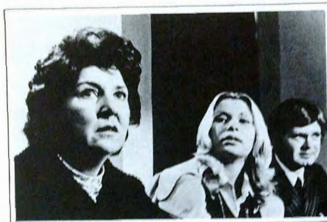
DOES ANYBODY NEED ME ANY MORE?